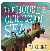
Book Club Aug 25