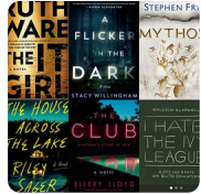
Books Books & Books