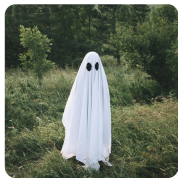
Bardstown Ghost Trek