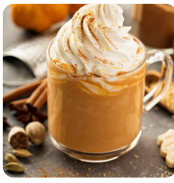
YEP! The PSL