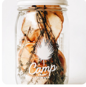
Camp Craft Cocktails